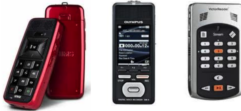
Fig. 2: DAISY player