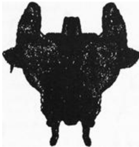
Figure 5. 2. An inkblot or... ?

Personal interests, occupations, and personality can strongly influence people's experience. This fact is used in tests like the Rorschach inkblot test that use interpretations of ambiguous figures for personality assessment. In a classic study of imagination, Bartlett noted that subjects asked to interpret inkblots frequently reveal much information about their personal interests and occupation. For example, the same inkblot reminded a woman of a "bonnet with feathers," a minister of "Nebuchadnezzar's fiery furnace," and a physiologist of "an exposure of the basal lumbar region of the digestive system." 2 See Figure 5. 2: what does the inkblot look like to you?