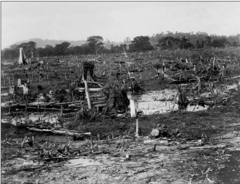
FIG. 3 Large Clearing at Firestone Plantation No. 3, Photograph by Loring Whitman, 26 July 1926. (Source: VAD 2035-329, courtesy of Indiana University Liberian Collections.)

also evolved into the film as well as multimedia and advocacy projects, which continue to grow (figs. 2–5).