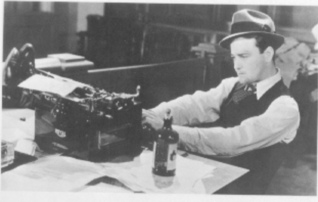
Photograph from 'Okay, America,' a 1932 film directed by Tay Garrett.

has given Americans the archetypical big-city reporter. That 'hoodlumesque half-drunken caballero' 14 of a reporter wears his rumpled fedora inside, keeps a whiskey flask in his bottom desk drawer, wisecracks out of one side of his mouth while smoking a dangling cigarette out of the other. Much of The Front Page is autobiographical. As a Chicago reporter, Ben Hecht, who wrote the play with Charles MacArthur, committed outrages no less questionable than those committed by the reporters in the play. He had pockets sewn in his coat lining to hold the burglar's tools he used to break into the homes of the bereaved, in search of photographs of murder victims and of murderers.