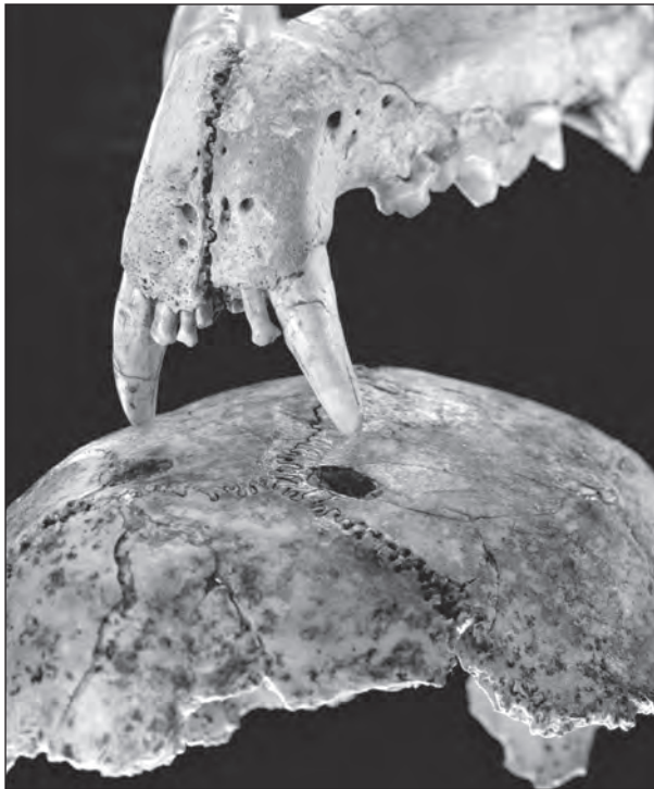
Figure 1. There is no other example from the fossil record that better documents the link between early hominids and carnivore feeding (and probable predation) than Bob Brain's observation of puncture holes in the juvenile hominid calotte (SK 54) from the Hanging Remnant of Swartkrans. The holes match exactly the spacing of the canine teeth of a fossil leopard mandible from the same deposit.

cordingly, predation probably influenced their social organization and perhaps other aspects of their biology. Verifying the causal links predicted on good theoretical grounds between predation pressure and socioecology is vexing even in modern higher primates (e.g., Zuberbühler and Jenny, 2002), which are observable—much less in the fossil record, in which behavior can only be inferred (Pickering, 2005).