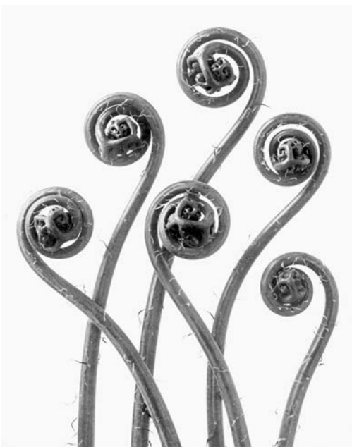
FIGURE I.1 left Karl Blossfeldt, Equisetum hyemale , 1898–1928. Gelatin silver print, 23\frac{7}{16} \times 9\frac{5}{16} inches (59.5 × 23.7 cm). Thomas Walther Collection, gift of Thomas Walther, the Museum of Modern Art.