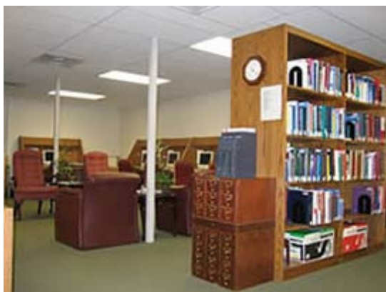
Card Catalog & Computers