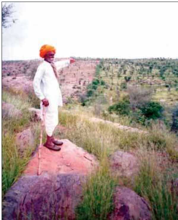
Figure 1. A villager showing the difference in vegetation on either side of the fence.

BAIF Institute of Rural Development, an NGO that is implementing the project here initially recognized the problem and engaged the community to discuss about what could be done to improve the situation. The people reciprocated positively and agreed to part with half of the common grazing area for rehabilitation. The village stakeholder community consisting of grazers, herders and farmers through panchayat , resolved to erect stone fence around the 45-ha grazing land and not allow any cattle to graze in that area. Thus the area was fortified with physical and social fencing. The stakeholders agreed to take up rehabilitation of the grazing land in half the area initially so that the other half was accessible to common grazing. Villagers contributed their labor to erect stone fencing, and construct soil and rainwater conservation structures to arrest runoff and increase infiltration. Over 200 staggered trenches, 290 percolation pits and 6 gully plugs were constructed across the grazing land. Once