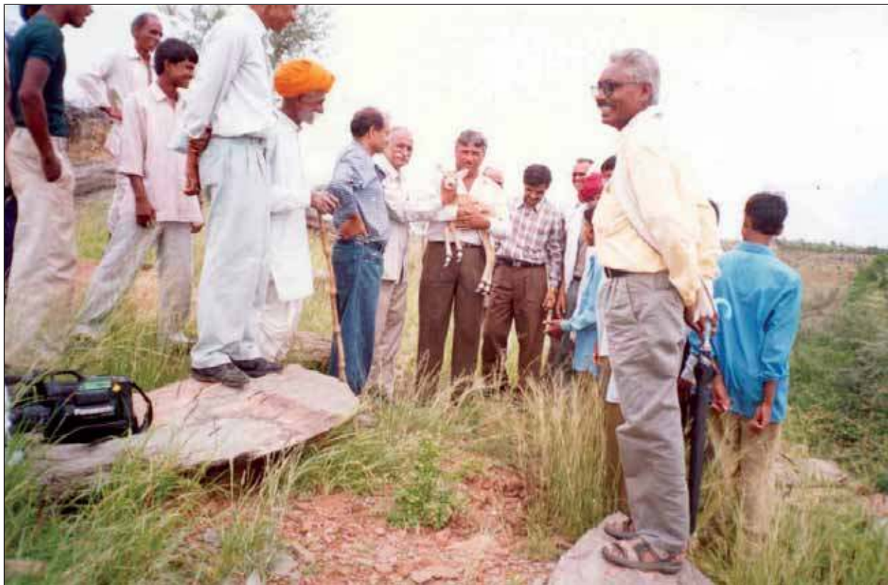
Figure 2. The PBA team with a blue bull calf.

The number of species of useful grasses and fodder has increased tremendously. Besides the flora, even the fauna was rehabilitated in this area. This area is a safe haven for nilgai [a species of wild cows (blue bulls)], adults and young ones. Rabbits, hares, jackals, foxes, mongooses and a host of bird species are found in this area. A biodiversity assessment was undertaken recently with the community participating actively in enumerating and listing the uses of the various herbs, shrubs and grasses that have been rehabilitated in this area (Fig. 2).