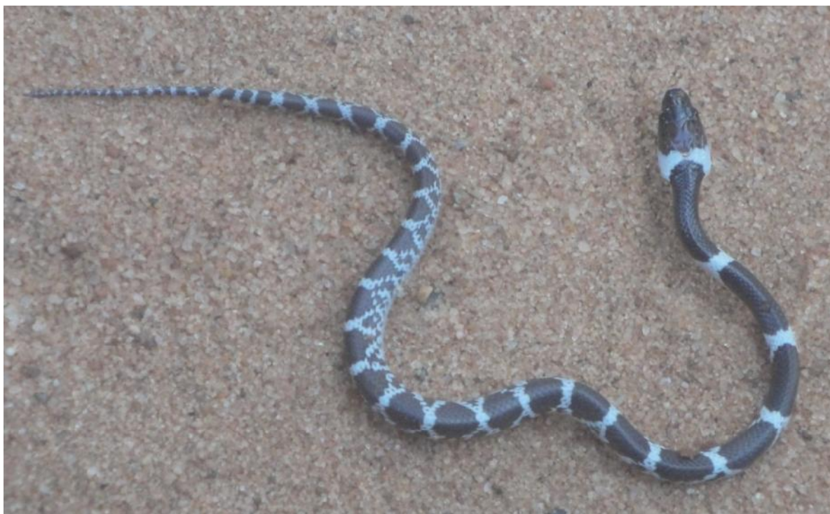
Figure 2. Dryocalamus nympha in Pondicherry university campus, India

D. nympha was observed in under bark and root of Tectona grandis and Acacia auriculiformis during moon soon season at central instrumentation facility building in Pondicherry University campus which is surrounded by lush vegetation (Figure 2). According to IUCN, D. nympha are uncommon in this region, are listed under not evaluated category (NE), and it is protected by wild life protection act under schedule IV, which is not reported by earlier studies. Hence, this study is confirmed that D. nympha is first reported from Puducherry region.