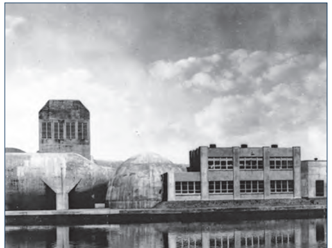
The 8-Foot HST at the NACA Langley Aeronautical Laboratory provided the means for testing large models and some full-scale components at a simulated speed of 500 miles per hour. (Image Number GPN-2000-001821)

Throughout the 1920s, the National Advisory Committee for Aeronautics (NACA), the predecessor agency to NASA, built the first wind tunnel complex at what was then Langley Memorial Aeronautical Laboratory ("Langley") located in Hampton, Virginia. Yet even with the world's first Full Scale Tunnel, completed in 1931, all the tunnels were subsonic. As Joseph Ames, Chairman of the NACA, recognized, the need to develop transonic research capabilities was a committee priority. By the late 1920s, Langley was already focused on designing the world's first high-speed tunnel (HST). The challenge was how to meet this emerging research need in the face of the Great Depression of the 1930s.