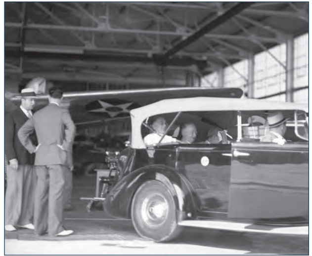
President Roosevelt visits Langley on 29 July 1940.